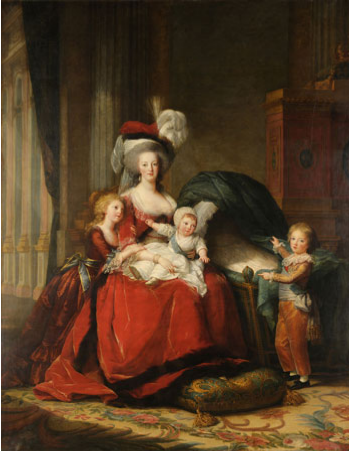
Elisabeth Vigée-Lebrun's immense following at the French court was largely due to the patronage of Marie-Antoinette, whom she has been credited with making sympathetic to posterity through her portraits of the queen. Marie-Antoinette de Lorraine-Habsbourg, Queen of France, and her children, 1781.

course, hear about the youths who neglected their studies and scribbled in the margins of their notebooks without ever becoming anything more elevated than department-store clerks or shoe salesmen. The great Michelangelo himself, according to his biographer and pupil, Vasari, did more drawing than studying as a child. So pronounced was his talent, reports Vasari, that when his master, Ghirlandaio, absented himself momentarily from his work in Santa Maria Novella, and the young art student took the opportunity to draw “the scaffolding, trestles, pots of paint, brushes and the apprentices at their tasks” in this brief absence, he did it so skillfully that upon his return the master exclaimed: “This boy knows more than I do.”