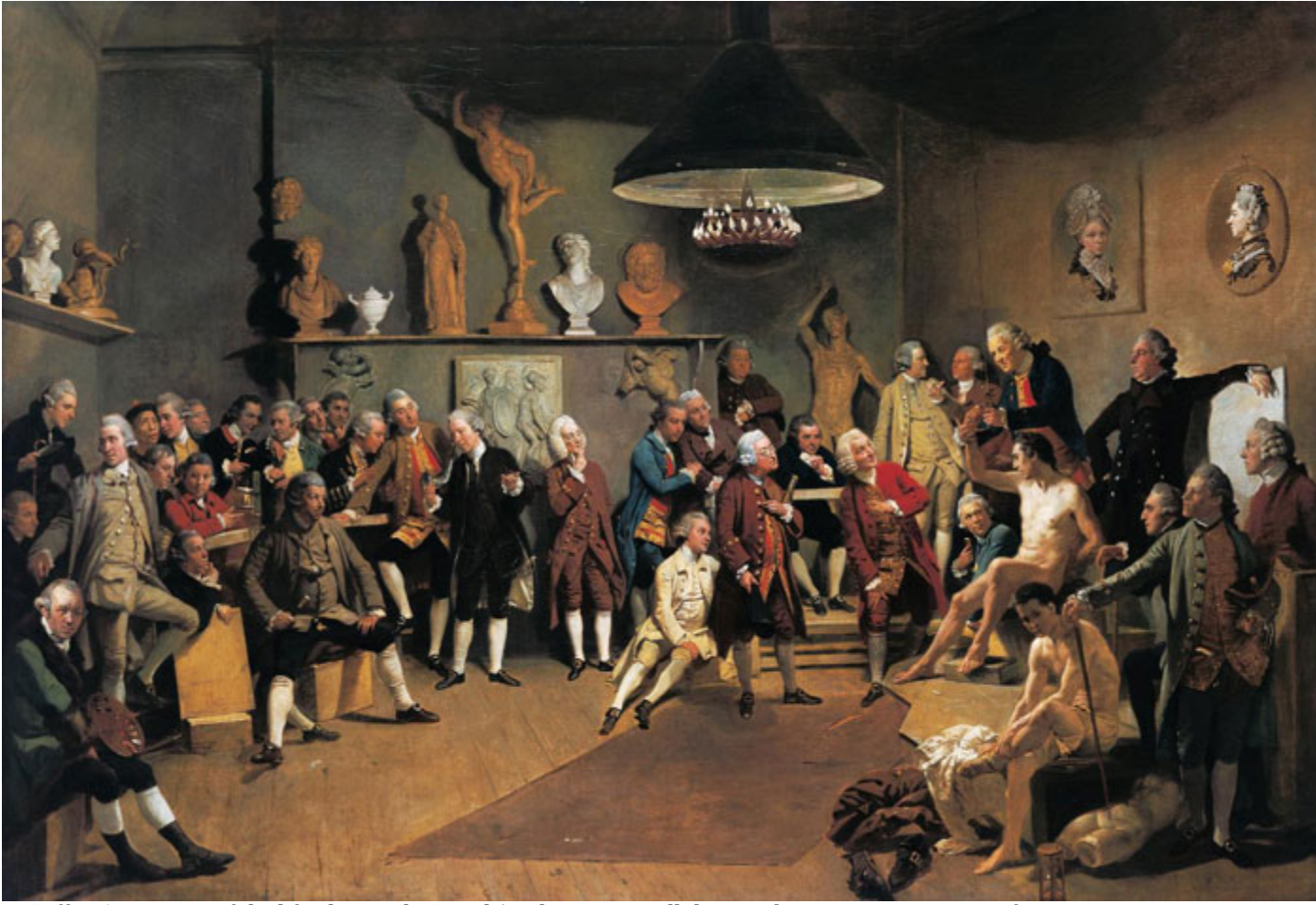
In Zoffany's painting of the life-class at the Royal Academy, 1772, all the members are present except for Angelica Kauffmann, who for reasons of propriety has a stand-in—her portrait on the wall.

There exist, to my knowledge, no representations of artists drawing from the nude model which include women in any role but that of the nude model itself, an interesting commentary on rules of propriety: i.e., it is all right for a (“low,” of course) woman to reveal herself naked-as-an-object for a group of men, but forbidden to a woman to participate in the active study and recording of naked-man-as-an-object, or even of a fellow woman. An amusing example of this taboo on confronting a dressed lady with a naked man is embodied in a group portrait of the members of the Royal Academy in London in 1772, represented by Zoffany as gathered in the life room before two nude male models: all the distinguished members are present with but one noteworthy exception—the single female member, the renowned Angelica Kauffmann, who, for propriety’s sake, is merely present in effigy, in the form of a portrait hanging on the wall. A slightly earlier drawing of Ladies in the Studio by the Polish artist Daniel Chodowiecki, shows the ladies portraying a modestly dressed member of their sex. In a lithograph dating from the relatively liberated epoch following the French Revolution, the lithographer Marlet has represented some women sketchers in a group of students working from the male model, but the model himself has been chastely provided with what appears to be a pair of bathing trunks, a garment hardly conducive to a