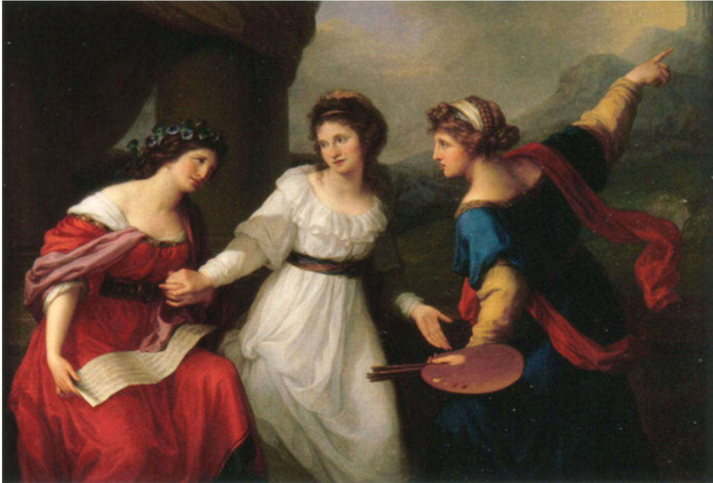
The Swiss-born Angelica Kauffman, most of whose prolific career was spent in Italy, combines allegory with portraiture in Angelica Hesitating between Music and Painting, 1791.

undertaken from a feminist point of view, like the ambitious article on women artists which appeared in the 1858 Westminster Review , 2 or more recent scholarly studies on such artists as Angelica Kauffmann and Artemisia Gentileschi, 3 are certainly worth the effort, both in adding to our knowledge of women's achievement and of art history generally. But they do nothing to question the assumptions lying behind the question "Why have there been no great women artists?" On the contrary, by attempting to answer it, they tacitly reinforce its negative implications.