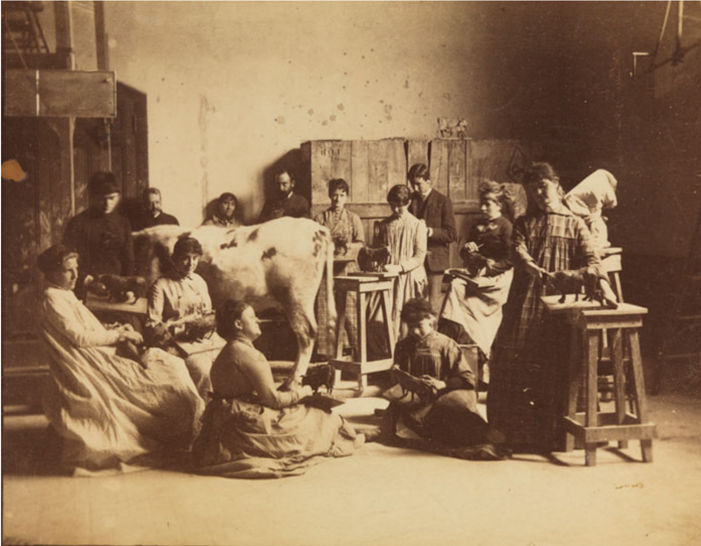
At Thomas Eakins' life-class at the Pennsylvania Academy around 1855, a cow, instead of a nude man, served as a model for the women students.