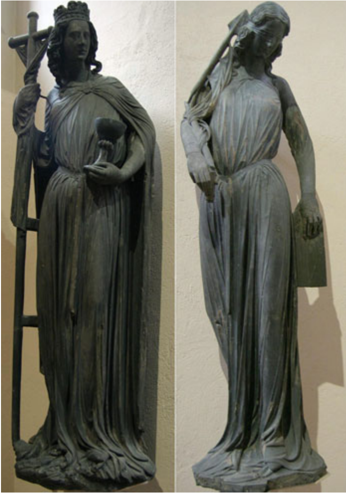
The monumental figures of The Church and The Synagogue from the South Portal of the Cathedral of Strasbourg, ca. 1225, are attributed to Sabina von Steinbach, daughter of the master-sculptor of the cathedral, who died before the completion of the work.