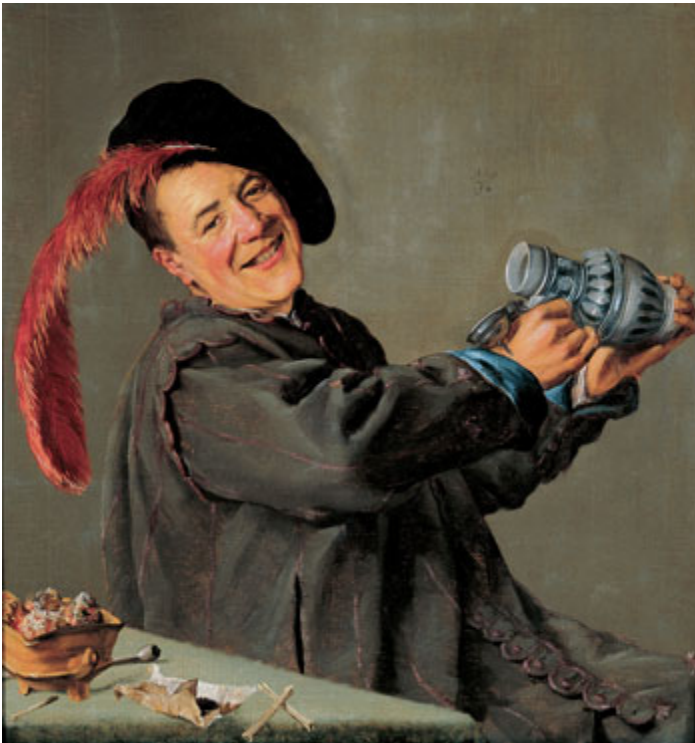
Judith Leyster's The Jolly Topper was called a Frans Hal until the discovery of her typical signature, “J,” and the date 1629, in upper right center.

The fact of the matter is that there have been no supremely great women artists, as far as we know, although there have been many interesting and very good ones who remain insufficiently investigated or appreciated; nor have there been any great Lithuanian jazz pianists, nor Eskimo tennis players, no matter how much we might wish there had been. That this should be the case is regrettable, but no amount of manipulating the historical or critical evidence will alter the situation; nor will accusations of male-chauvinist distortion of history. The fact, dear sisters, is that there are no women equivalents for Michelangelo or Rembrandt, Delacroix or Cézanne, Picasso or Matisse, or even, in very recent times, for de Kooning or Warhol, any more than there are Black American equivalents for the same. If there actually were large numbers of “hidden” great women artists, or if there really should be different standards for women’s art as opposed to men’s—and one can’t have it both ways—then what are the feminists fighting for? If women have in fact achieved the same status as men in the arts, then the status quo is fine as it is.